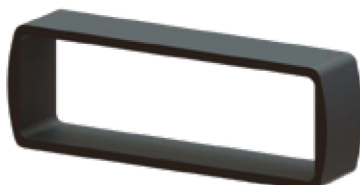
Surface Mount Sleeve