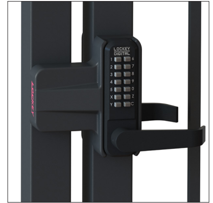
shown on ornamental