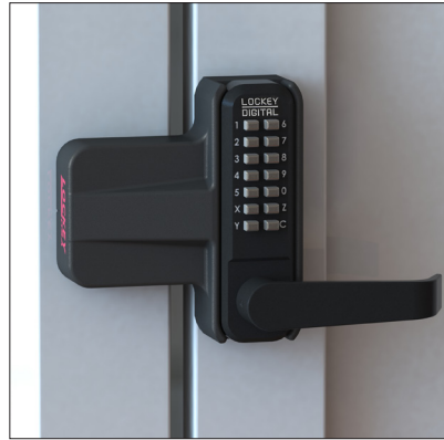
shown on vinyl