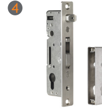
This lock comes with a weldable lock box (housing)