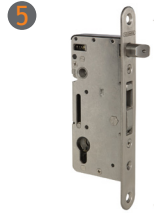
Solid Wood Frames of 3 -1/2" and up 2-3/8" backset