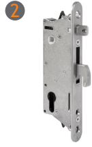
Square Frames of 2 -1/2" and up 1-9/16" backset