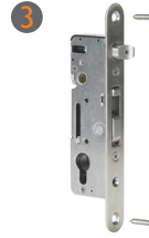
Square Frames of 2 -1/2" and up 1-3/8" backset